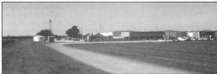
Covering several acres in south Texas, the Kunafin Insectary is one of the largest in the world. It supplies bugs to over a dozen countries.

The company, which produces and supplies beneficial insects, sets up an extensive monitoring schedule for each operation.